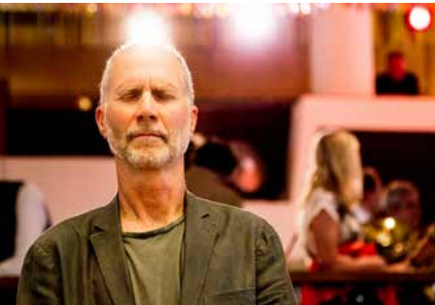
John Luther Adams.

I never imagined I would write a string quartet. Then I heard the JACK Quartet, and I understood how I might be able to make the medium my own. The result was The Wind in High Places —a twenty-minute work composed entirely on natural harmonics and open strings.