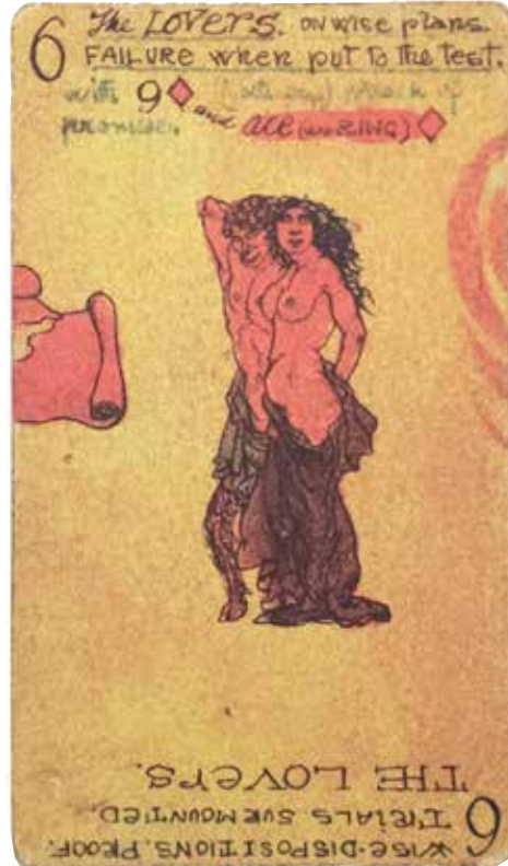
From the private Tarot deck of 'London's Lost Artist' and occultist, Austin Osman Spare