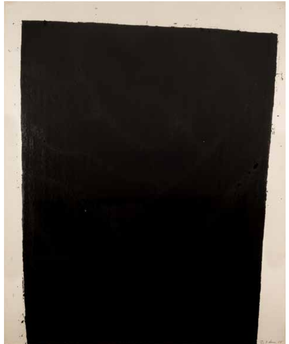
Richard Serra, Muddy Waters , 1987. Private collection