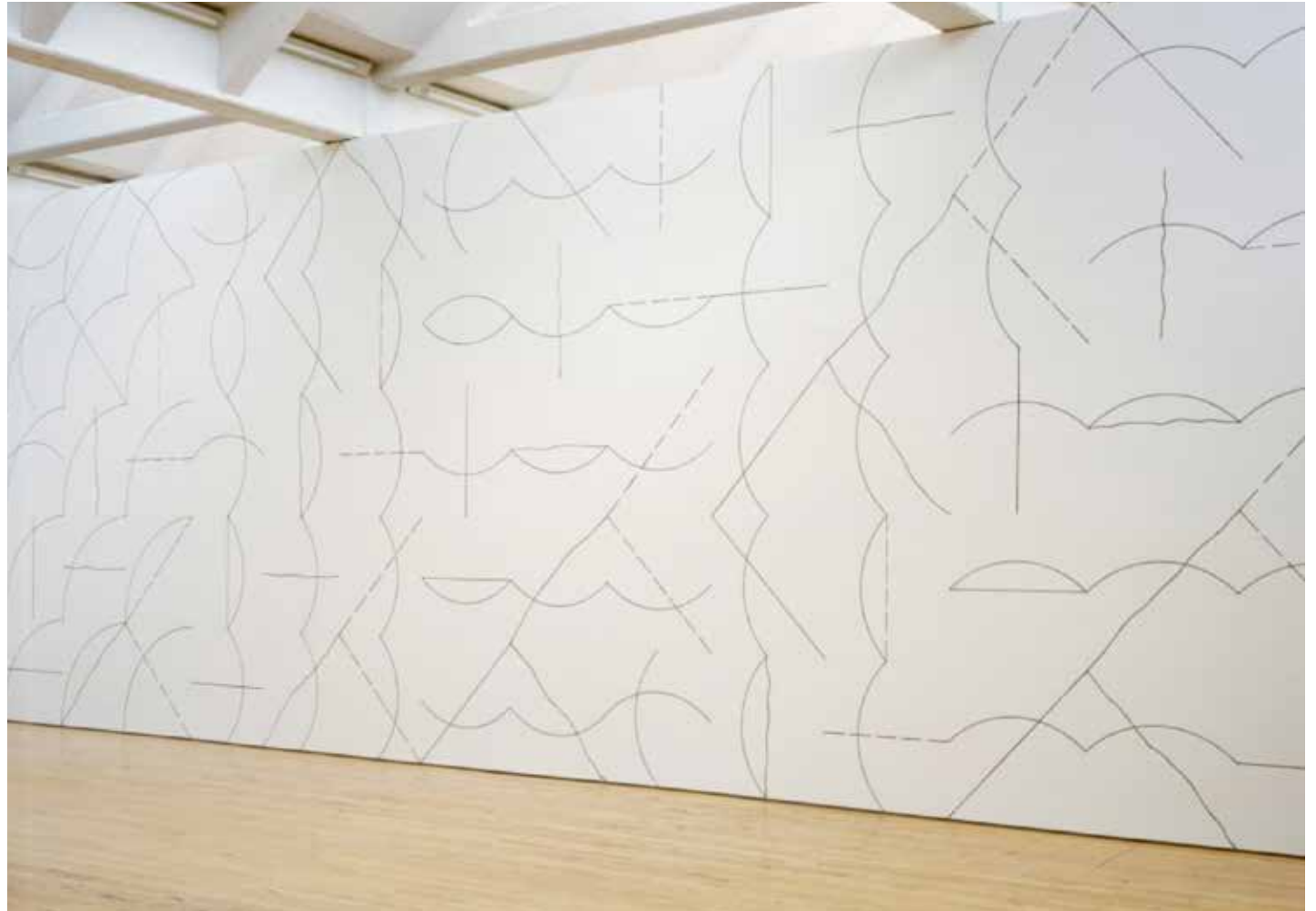
Sol LeWitt, Wall Drawing #136: Arcs and Lines , 1972. © Sol LeWitt/ARS, New York.

Periods of existence is about mobility and constantly changing colors in a quite static framework of repetitions, like panels of painted glass. The work is composed from a constrained set of elements which combine and recombine over the course of the piece, and with strong local contrasts between mobility and stasis, as well as synchronicity vs. temporal offsets. The elements undergo slight variations but defend their existence to prevent too much evolution.