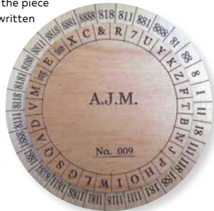
Union Army Cipher Disk

Realized simultaneously, cache is a conceptual process resulting in sound diffused through a large, modular speaker array. Using methods of databending, field recording, data sonification and others, I have collected materials from my direct surroundings while writing the piece presented here (the act of making a written score a non-musical, non-aesthetic sonic space): the materials are one step removed from the object you are hearing—sounds of coffee shops, airports, even this PDF file reinterpreted from its own raw data, sine tones, train motors, etc. Cache is an aural and audible archive for the incidental, the tangential, the hypertext and metadata that always exist but are always hidden.