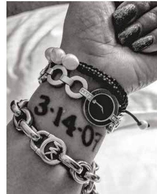
Ten Years Sober.