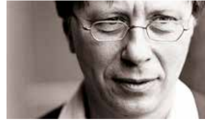
Georg Friedrich Haas.