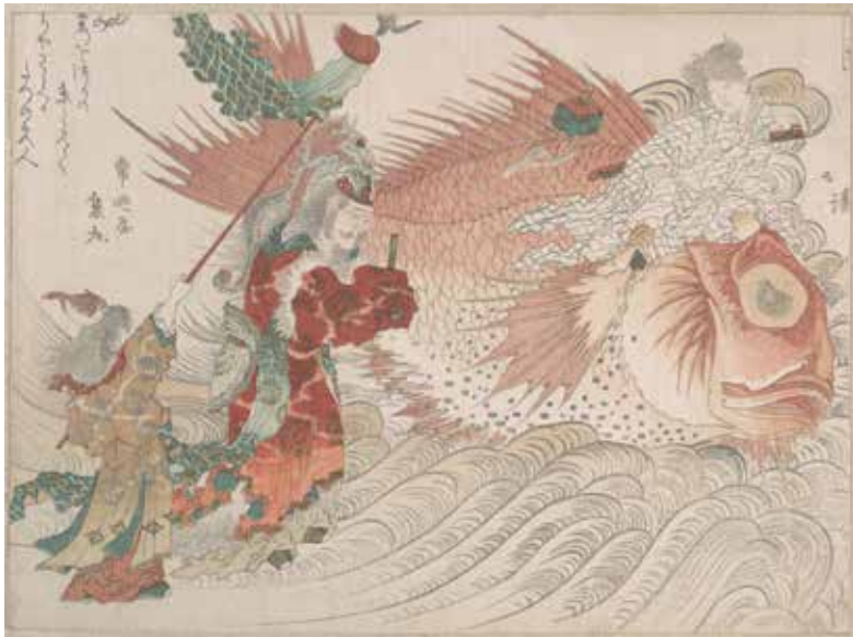
Totoya Hokkei (1780–1850), Urashima Taro Going Home on the Back of a Tai Fish, the King of the Sea Seeing Him Off