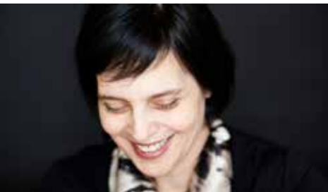
Chaya Czernowin.

This piece, with its long poetic name is a small window, looking as with a microscope into what makes small things move, what makes tissues of moving noise / sounds into a song. The instruments in the piece focus on very small areas of movement. In these areas, repeated restricted material seems to be dragged on various surfaces. In the second part of the piece the minuscule and effortful movements open the musical space to an unexpected negative space. 'Negative space' here can be seen as a musical continuity which evokes a notion of place, rather than that of an event or process. This space is revealed and formed by the musical actions and sounds. These sounds and actions frame, curve, and give rise to the space between them which is a space of deep colored silence.